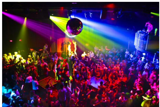
LIMASSOL BY NIGHT