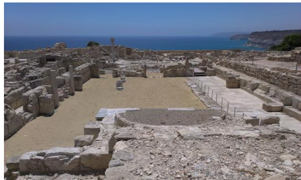
KOURION - Curium