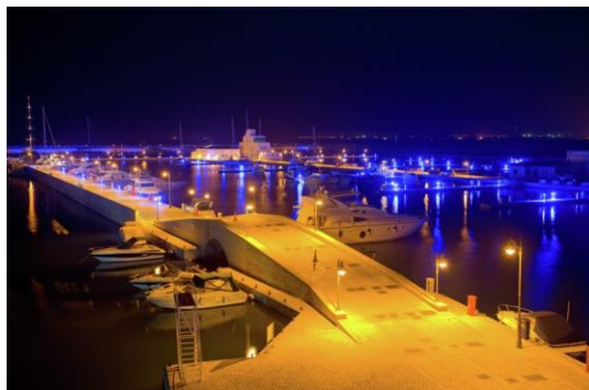
LIMASSOL MARINA - OLD HARBOUR